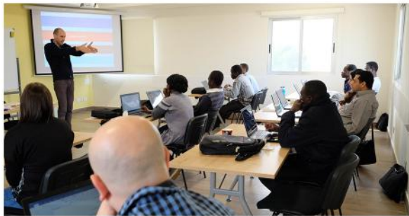
Students from across the MENA region study for ministry at ABTS.

Through CBM's STEP program we engaged in a three-year partnership at a commitment of $10k a year (fundraised) with Arab Baptist Theological Seminary in Beirut, Lebanon. ABTS helps equip leaders for vital ministry in the Middle East and North Africa (MENA) region. In 2022 we concluded our initial 3-year partnership.